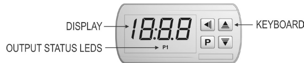
Fig. 2 – Frontal Panel

The N321 energizes the output relay such as to maintain the process temperature on the setpoint value defined by the user. The output status led P1 signals when the control output is on.